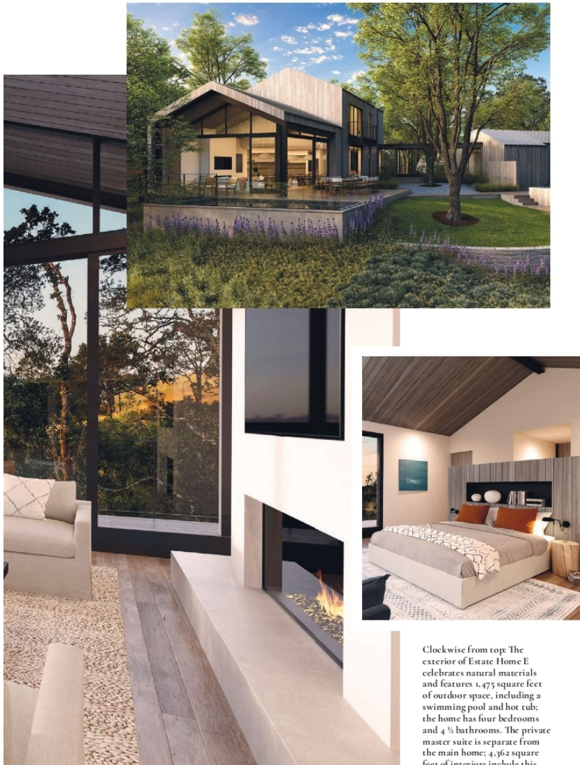
Clockwise from top: The exterior of Estate Home E celebrates natural materials and features 1,475 square feet of outdoor space, including a swimming pool and hot tub; the home has four bedrooms and 4 ½ bathrooms. The private master suite is separate from the main home; 4,362 square feet of interiors include this den that allows nature in.